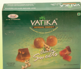
Amla Mix Sweet