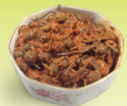
Marwadi Ker Sangri Pickle