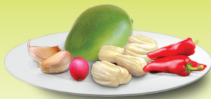
Mixed Pickle (sugar cane vinegar)