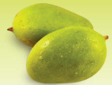
Sweet Mango Pickle,