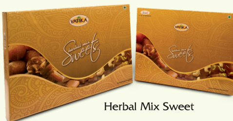
Herbal Mix Sweet