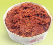
Marwadi Garlic Tadka Pickle