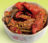
Marwadi Athana Red Mirchi Pickle